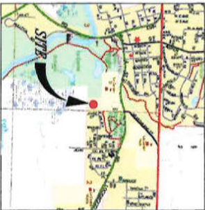
VICINITY MAP N1S